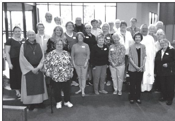
Lay Missionaries, MSC Sisters, and Clergy gathered for the Lay MSC Annual Commitment Ceremony in September.

The Lay Missionaries of the Sacred Heart are a group of ordinary people who share in the Charism of the Missionary Sisters of the Most Sacred Heart of Jesus (MSC). Like the Sisters, Lay MSC are called to respond to the love of the Sacred Heart and to make His love present to everyone within their own lives. The Lay MSC are a global community of Laity of the Chevalier Family in more than 30 countries. They gather together with the MSC Fathers, Brothers, Daughters of Our Lady of the Sacred Heart and