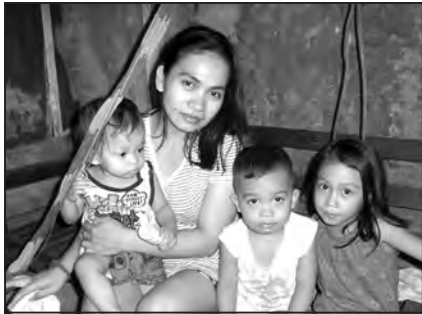
Sisters visited with this Filipino family in their home in Manila.

of the Sisters who felt shock and empathy for these families who live together in one or two room houses with dirt floors and few possessions. Some of the homes sit by a river bank which is polluted by trash and human waste as the government does little to provide for their peoples' basic human needs. Often the children live with their grandparents because their parents have to travel far away to find work so that they can earn money just to