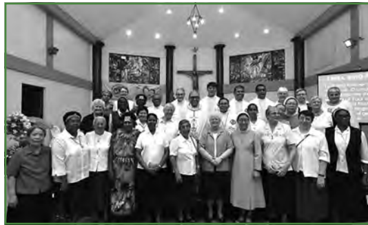
MSC Sisters gathered in Manila during February for their General Conference.

Sacred Heart today? Do we trust that the Spirit is present and creatively at work in our midst?" Following these introspective questions, participants engaged in reflection, prayer and sharing in order to reach a new vision of how MSC wish to be today and into the future.