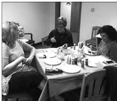
Fireside Chat guests enjoy conversation and creativity while painting rocks they would then place around Berks County.