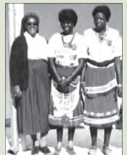
Congratulations to our Namibian MSC Sisters who recently celebrated 90 years of ministry.

We look forward to celebrating many more years of mission among our MSC Provinces as we follow our Founders' dream to reach all people everywhere with the love of the Heart of Christ! †