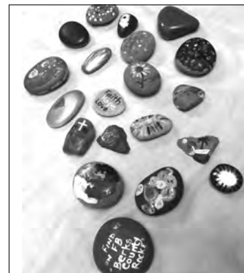
A sampling of the rocks created by Sisters and guests at the May 2018 Fireside Chat.