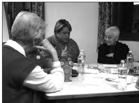
MSC Sisters and guests discuss the film "God is the Bigger Elvis" at the March 2018 Fireside Chat.

The months of March, May and November this year were marked by three very different Fireside Chats. The first, which celebrated National Catholic Sisters Week, centered around a movie titled "God is the Bigger Elvis", a