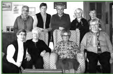
The communities of Madrid and Romania