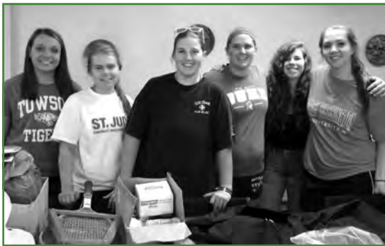
Bag packing is an exhausting part of mission preparation. Thanks to this group of young prior missionaries, the job was conquered quickly.

favorite of all the activities we hosted. Maybe it was the party atmosphere, maybe it was the music and the dancing, maybe it was the opportunity to really spend time with and bond with some of the people. Whatever the