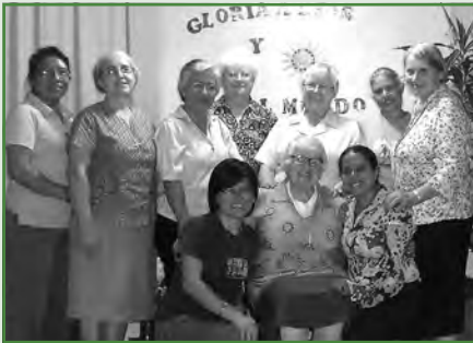
The communities of Guatemala and El Salvador