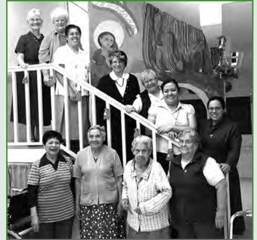
Our U.S. Province Sisters in Mexico