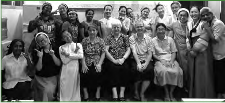
The multicultural community of Manila