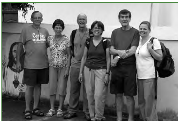
Some of the missionaries from St. Columbkille's Parish, Boyertown, PA.