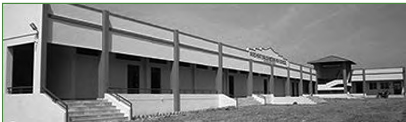
Monies generously gifted to the United States Province of the MSC Sisters through the Pontifical Mission Society Appeals in parishes across the country contributed to the building of Sacred Heart School in Kurugodu, India which was inaugurated on June 22, 2015. We thank and bless our donors!